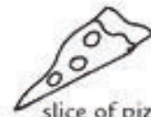
slice of pizza